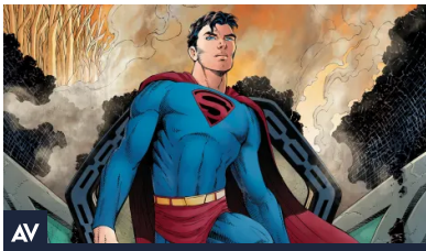
Frank Miller and John Romita Jr. reunite in this Superman: Year One exclusive