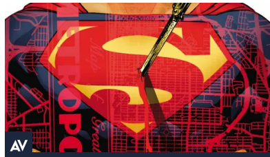
Superman confronts a crooked politician in this Action Comics exclusive

$699 average annual savings for drivers who switch and save. Progressive